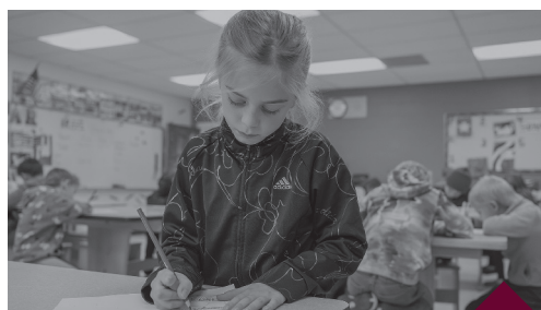
From pre-K to high school, our students are engaged and bringing their imagination to life. The district's commitment to art education continues to increase opportunities for students to be creative throughout their time at FFCS.