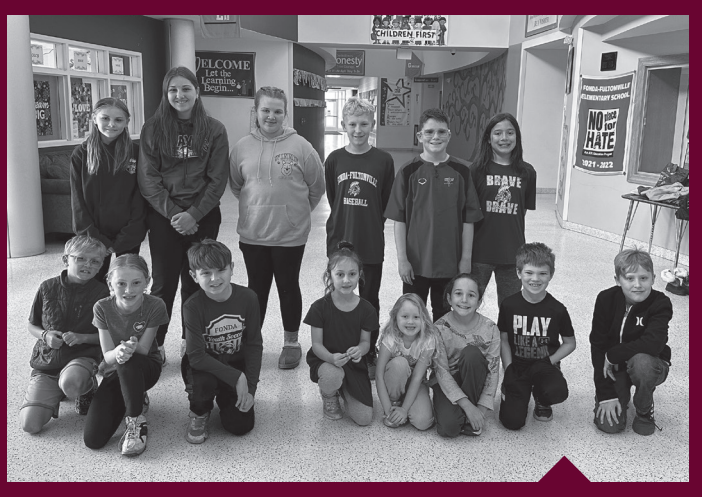
Congratulations to our elementary and middle school students who continue to raise awareness for important causes.

To learn more about this program, please visit the Read for Ronald McDonald House Charities of the Capital Region website at https://rmhcofalbany.org/.