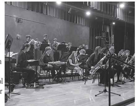
FFCS High School musicians kick off the 20th anniversary of the FFCS Jazz Fest concert series this spring.

Here's to another successful 20 years of music!!