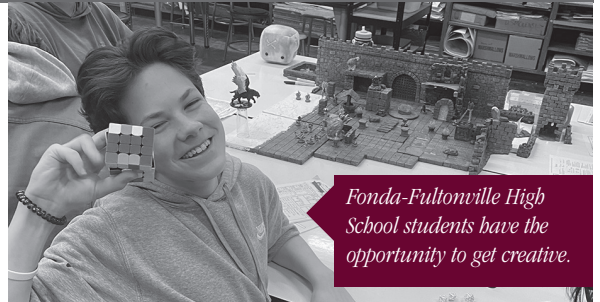
Fonda-Fultonville High School students have the opportunity to get creative.