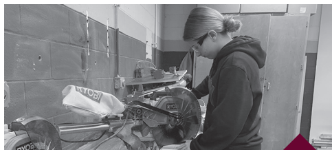
Bringing career pathways to light at FFCS High School. Students learning important skill sets for tomorrow.